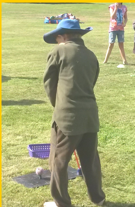
Room 3 & 4 taking to Golf like fish to water!